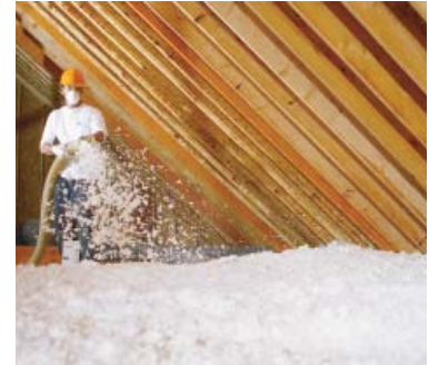
In attic applications, EcoFill Wx blows smooth and fast, providing superior coverage.